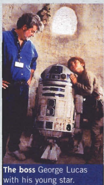
The boss George Lucas with his young star.

Wow! At ten years of age, Jake already sounds like a Hollywood professional ! Actually , he’s been acting for half of his life and started making commercials when he was five. Before The Phantom Menace he was also on the hit US TV show ER . What does he do when he’s not working? “I ride my bike and play video games,” he said. “I go rollerblading and spend my time walking my dog J.J. ” ■