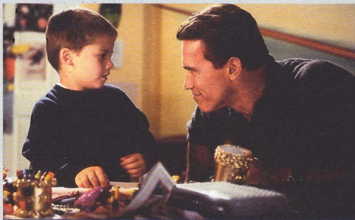
Jingle All The Way Little Jake and muscleman Arnold.